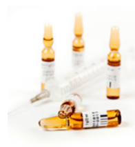
Biotechnology / Biochemistry